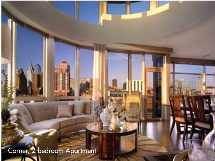
Corner, 2-bedroom Apartment