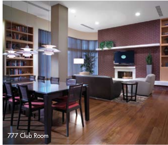
777 Club Room